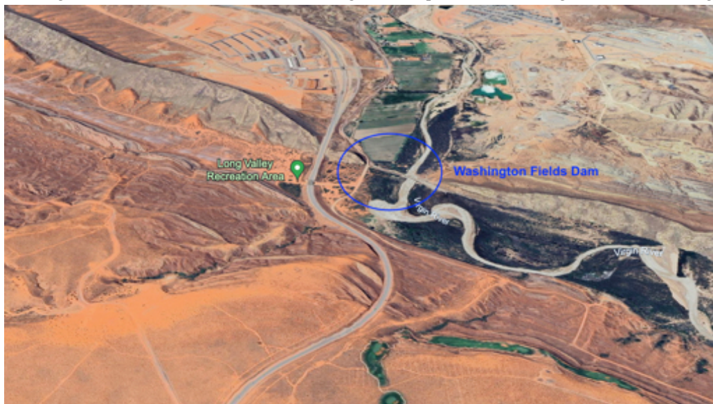
Washington Fields Dam location on Virgin River as it crosses rock strata