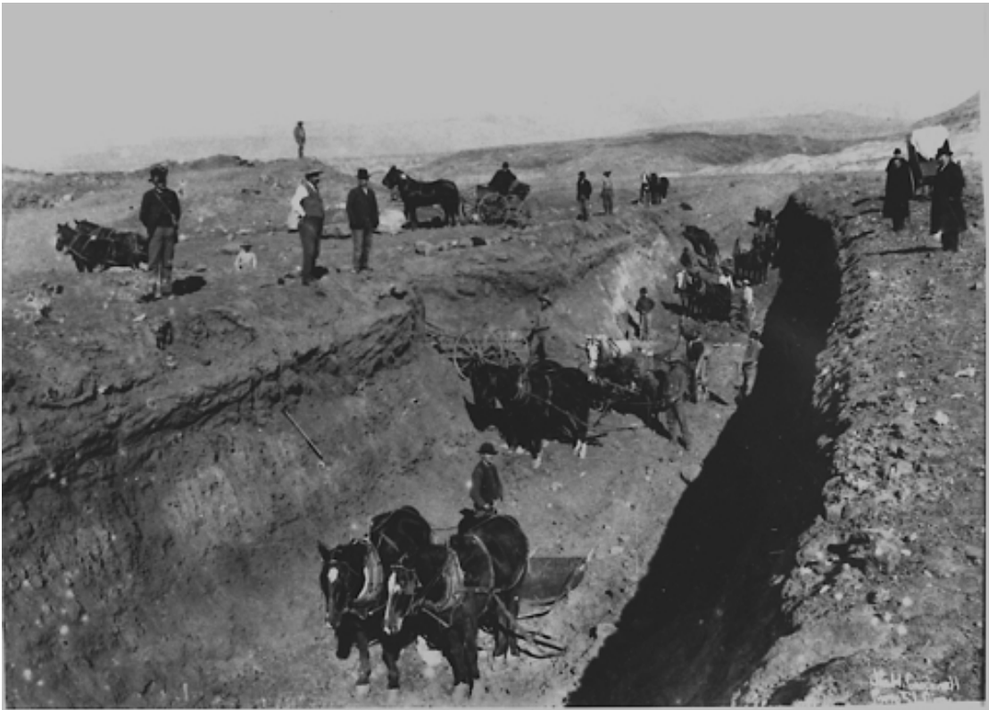
Construction on Saint George and Washington Irrigation Company Canal