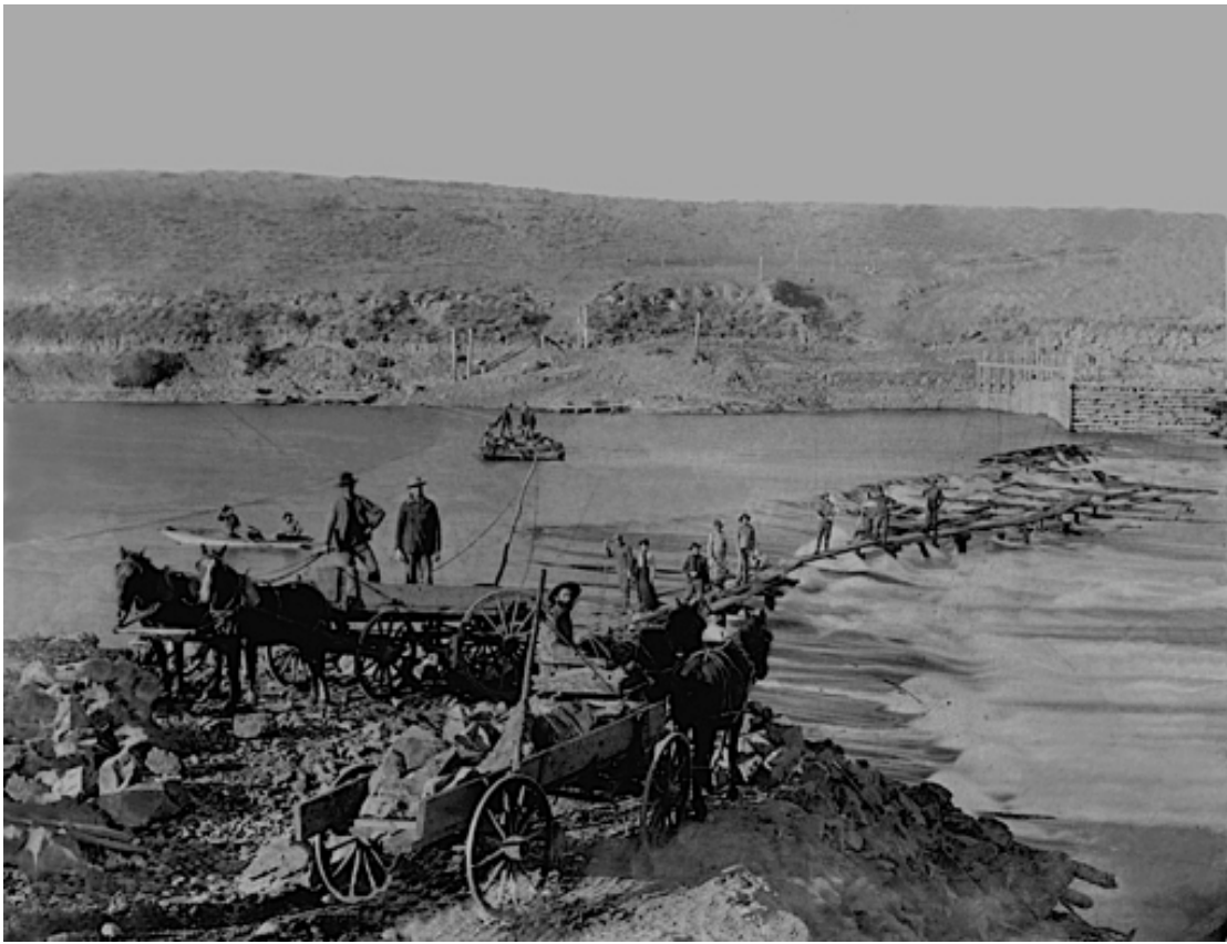
Construction on Washington Fields Dam Spillway