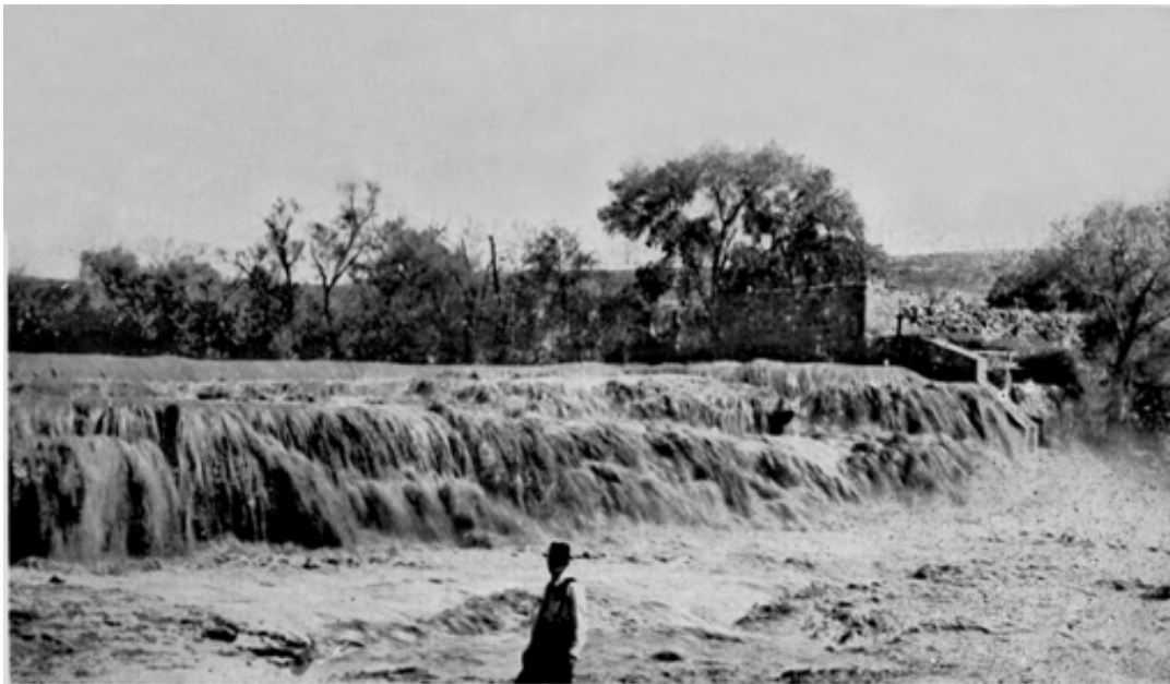
Washington Fields Dam Spillway during Flood