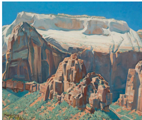
Maynard Dixon, West Walls of Zion (1933)