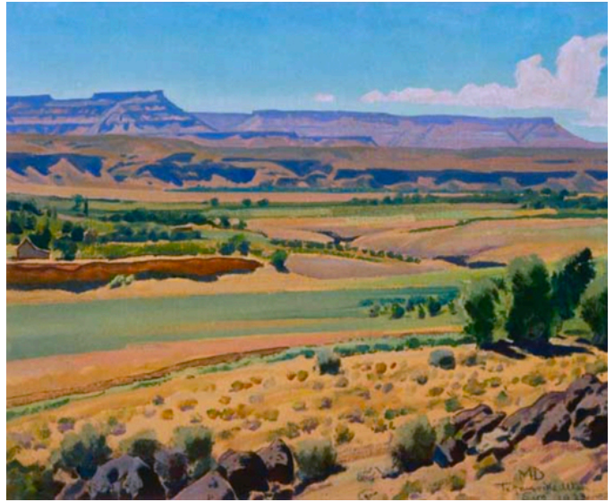
Maynard Dixon, Fields of Toquerville (1933)

Maynard Dixon: To the Desert Again PBS Utah 1 hour https://www.pbs.org/video/utah-history-maynard-dixon/