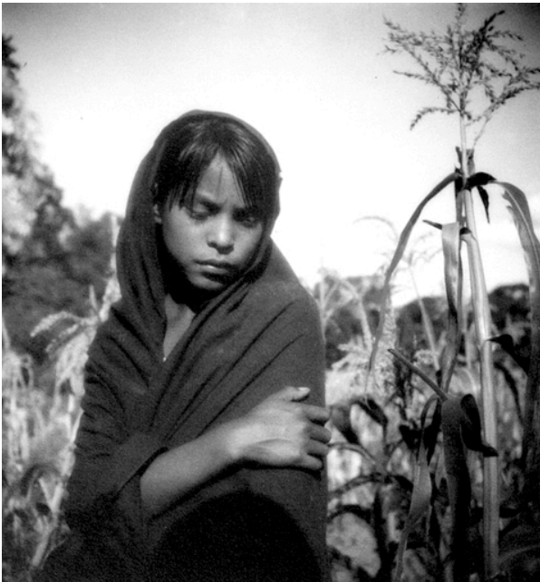
Dorothea Lange, Corn Maiden (1933?)

Maynard Dixon: To the Desert Again PBS Utah 1 hour https://www.pbs.org/video/utah-history-maynard-dixon/