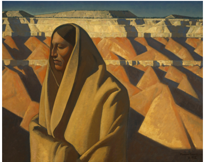
Maynard Dixon, Earth Knowler (1931-1935)