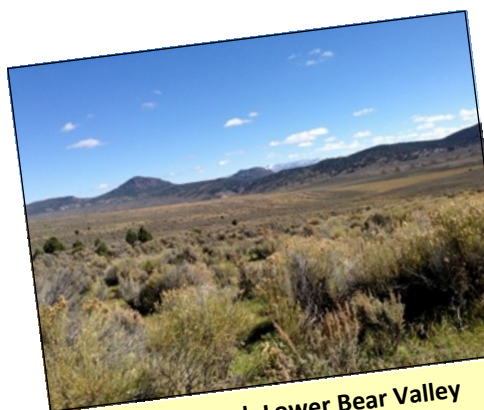
We'll hike through Lower Bear Valley