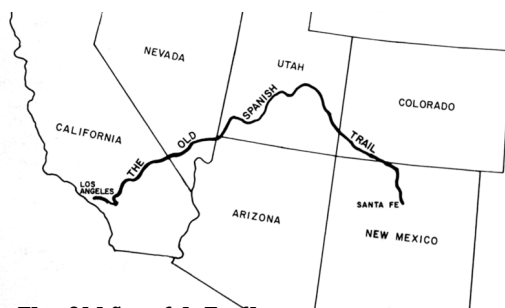
The Old Spanish Trail

We'll walk the Old Spanish Trail and hear the stories of this trade and travel "highway" that is so rich in history and folklore.