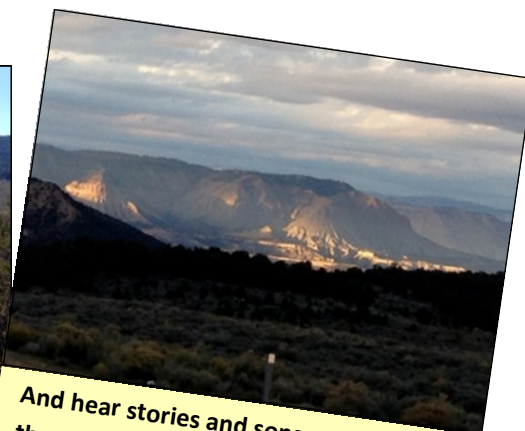
And hear stories and songs as we enjoy the view from the top