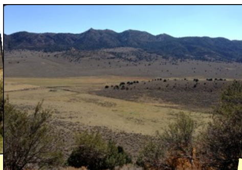
And take photos along the way to Upper Bear Valley