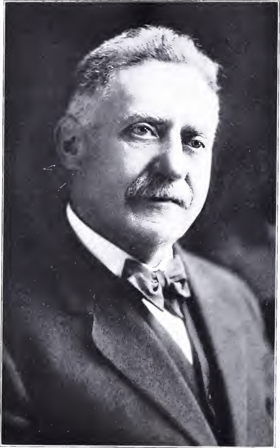
HON SIMON BAMBERGER UTAH'S ENERGETIC AND PATRIOTIC WAR GOVERNOR