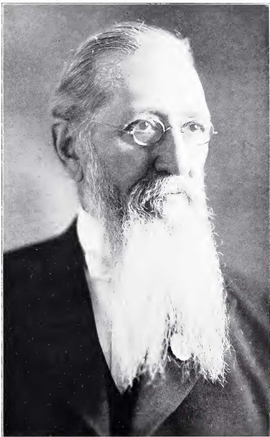
HON. JOSEPH F. SMITH

WHO PLACED AT THE SERVICE OF HIS COUNTRY THE MOST EFFICIENT NON-MILITARY ORGANIZATION IN THE UNITED STATES