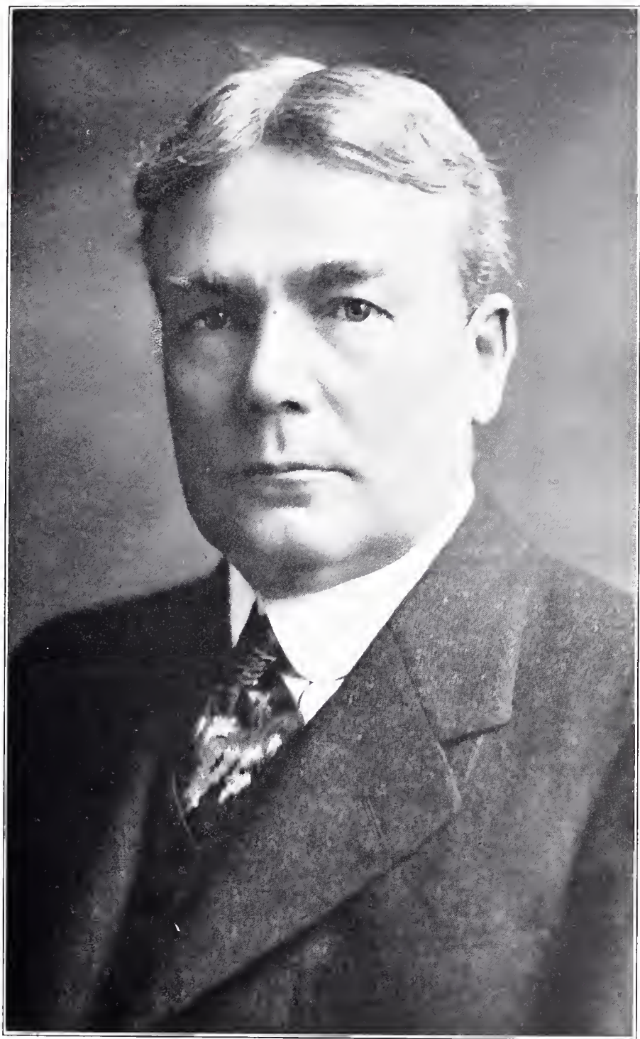
HON. W. W. ARMSTRONG FEDERAL FOOD AND FUEL ADMINISTRATOR FOR UTAH