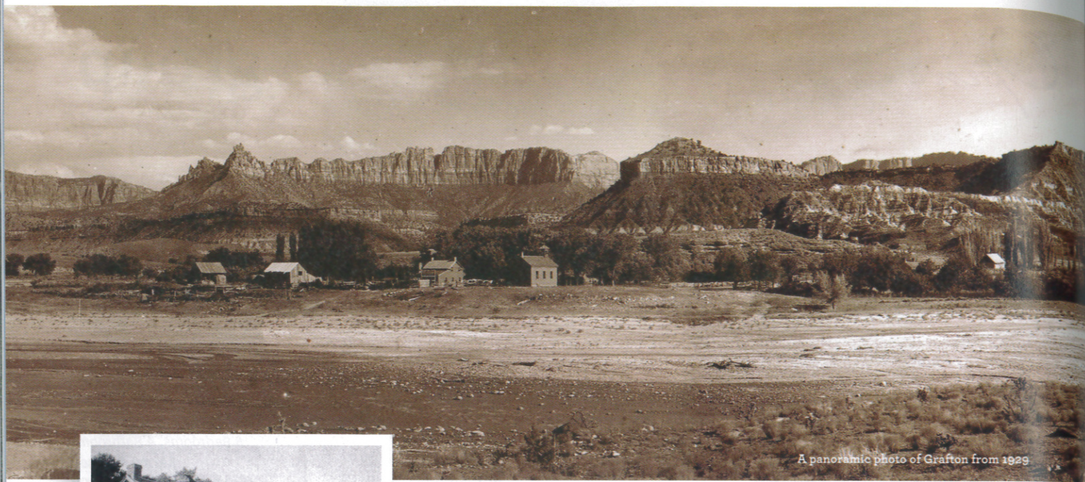
A panoramic photo of Grafton from 1929