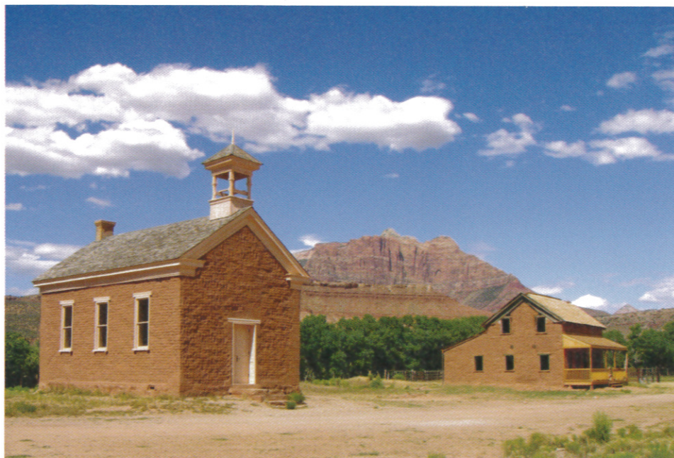
The restored Grafton schoolhouse, front, and the Russell home during its restoration in June of 2004.